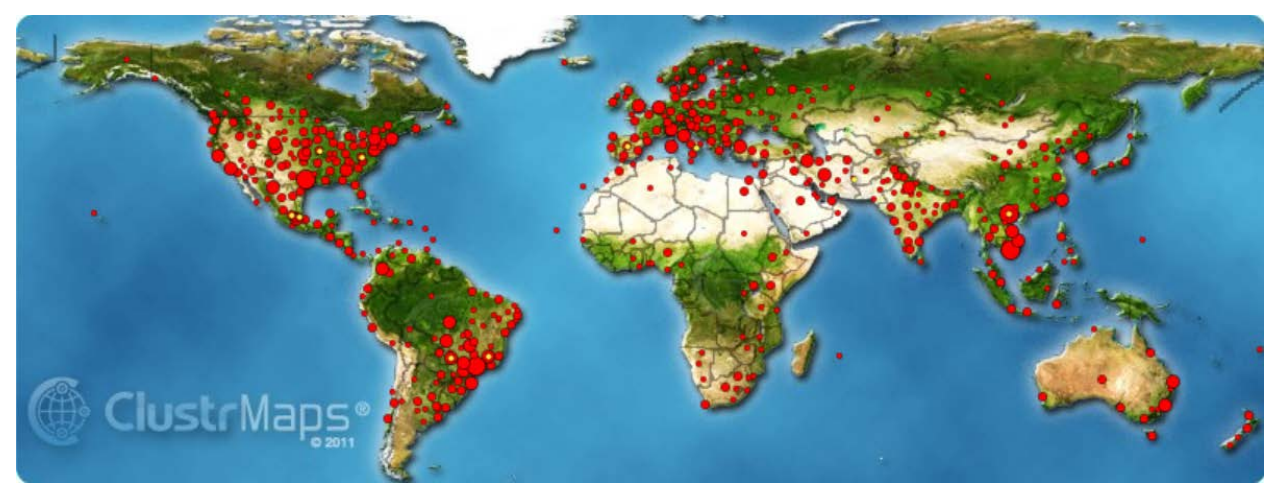
Figure 1. World map showing more than 26,000 visitors to the http://nutritionmodels.tamu.edu website since 2006. On March 2014, the countries that visited more were Vietnam (>7,900), United States (>5,200), and Brazil (>3,700).

environmental and management conditions. In these cases, DSS can be used as virtual simulators to predict nutritional requirements and feed utilization in a variety of production settings.