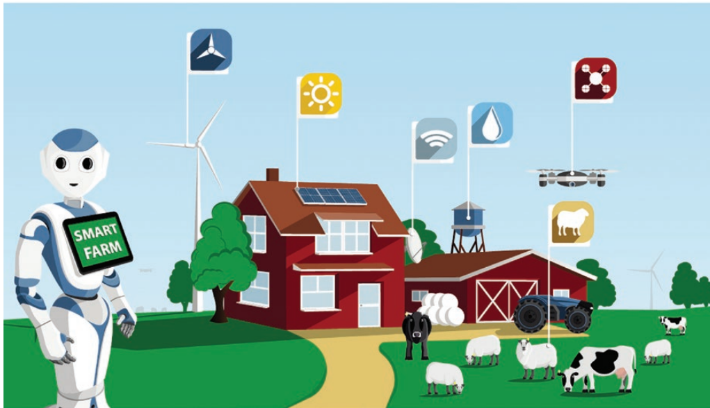
Figure 2. Illustration of different sensor components associated with the IoT to assist in integrating DST within the concept of smart farming or PLF systems. Adapted with permission from Tedeschi (2020) .